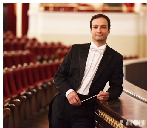
Orchestra « YOUNG BELARUS », Belorussia

Graduated from the Belorussian State Academy of Music in 2004