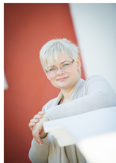
Harju String Orchestra, Estonia

In 2013, she was nominated “conductor of the year” by the Estonian Orchestra Conductor Association.